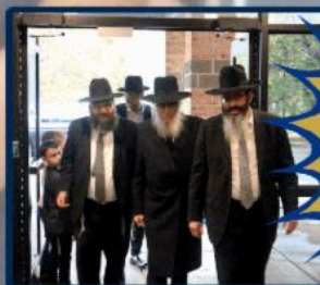
Rav Alster's Visit To Tl